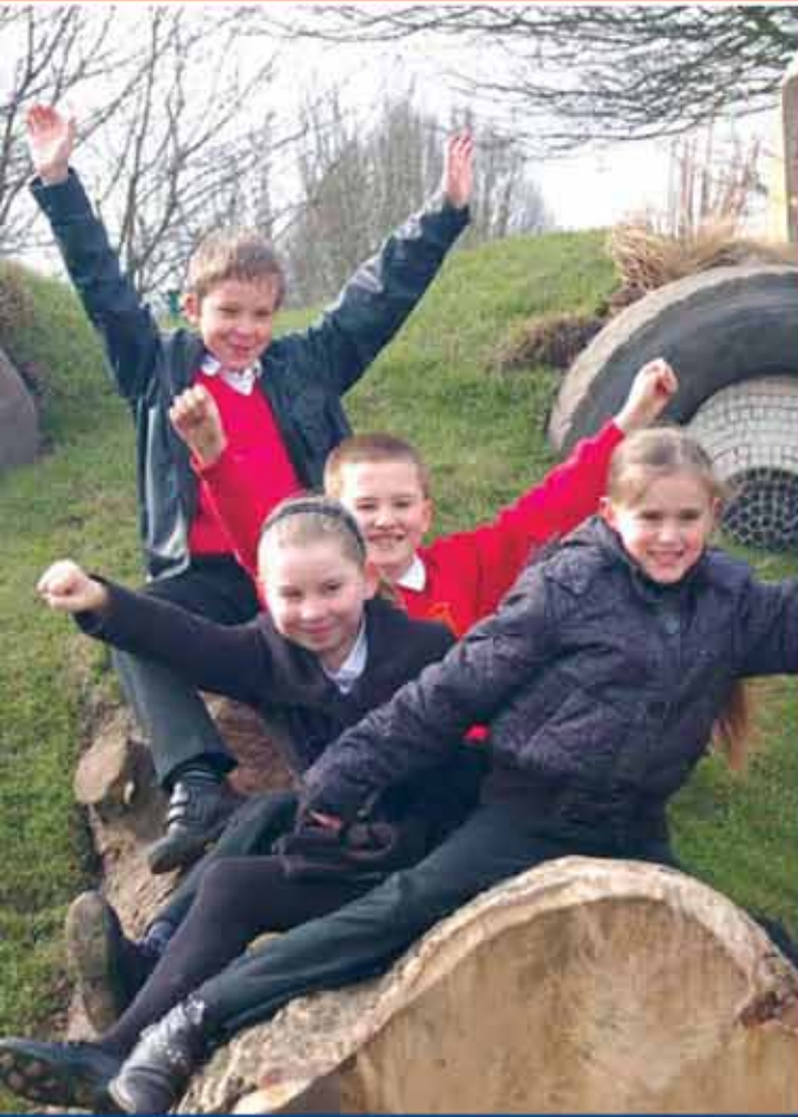
Springhead pupils get on board their new play area