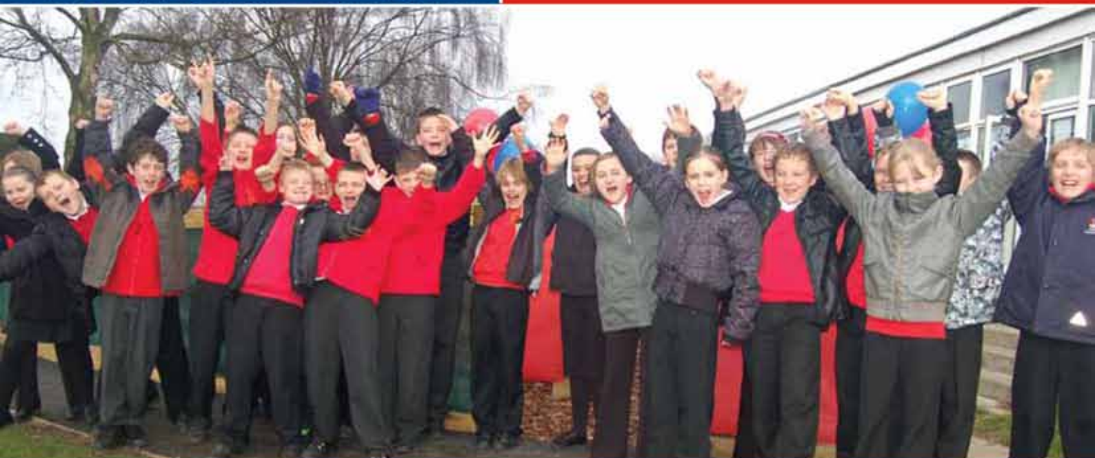
Pupils at Springhead Primary School celebrate their new improved playground

The school won the opportunity to create the memory garden after winning a competition set by the Realise Foundation.